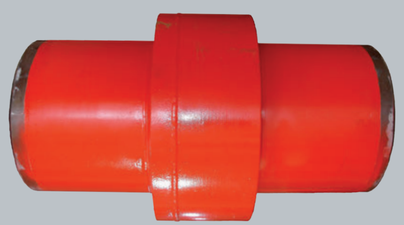
Close-up of Pipe Pup Style Monolithic Isolating Joint

The information contained herein is based on data and information developed in the Laboratories of Sypris Technologies ("Seller"), but is presented without guarantee or warranty, and the seller disclaims any liability incurred from the use thereof. Nothing contained herein is to be construed as a recommendation for any use, including without limitation, any use in a commercial process not controlled by seller, nor for use which is in violation of any existing patent, foreign or domestic or of applicable laws and regulations.