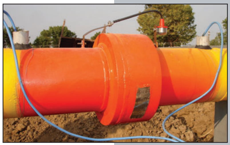
Installed Pipe Pup in the field.