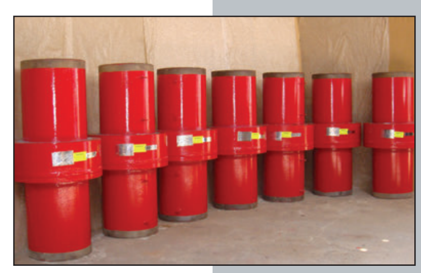
Seven Pipe Pups ready for shipment.